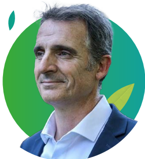
Eric Piolle Mayor of Grenoble

The greening of a city can only be carried out by the city and its surrounding towns. Therefore, the "Green Your City!" plan will allow Grenoble residents to either receive one or more of 19 protected species of trees free of charge, or the ability to turn an unused space in their neighbourhood into a