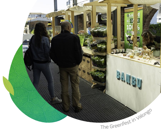
The Greenfest in Valongo