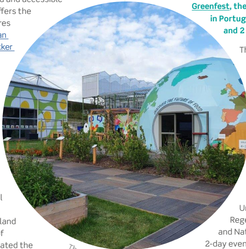
The Floriade Expo

Greenfest Valongo brought together people from different backgrounds and generations, discussing and presenting solutions to some of the most urgent problems regarding sustainability.