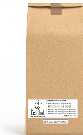
Optional logo example on product