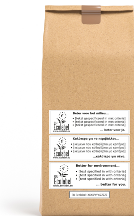
Optional logo example on product