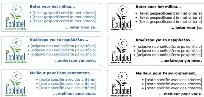
Optional logo example.

Create different boxes for each different EU language translation.