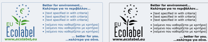
Optional logo example.