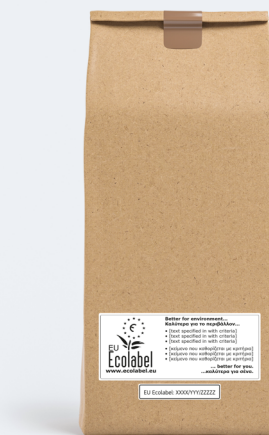
Optional logo example on product